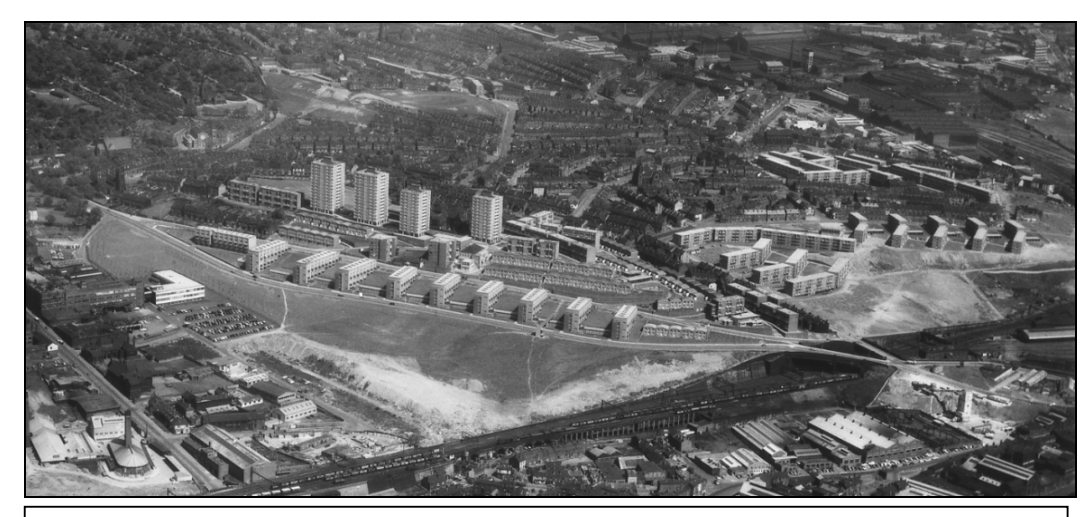
Figure 3: The Woodside Estate was created by total clearance of a large area of terraced and back-to-back housing. The entirely new landscape and plan form was separated from an adjoining industrial area (in the foreground) by open space.