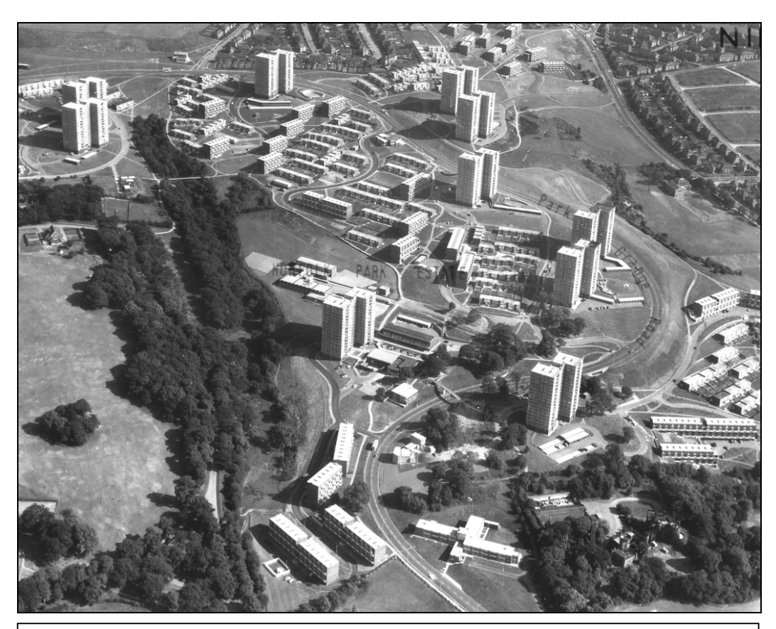
Figure 1: Norfolk Park Estate in 1969.

This zone includes a number of large scale mostly high rise municipal housing projects, making much use of non traditional construction techniques and designs. Typically these estates used a mixture of high rise towers and lower rise blocks of 'maisonettes', in which many flats shared common utility services, amenity facilities and access routes. Pedestrian and vehicular traffic was generally strictly separated and most estates were designed as independent communities with their own schools, shopping facilities, public houses and places of worship.