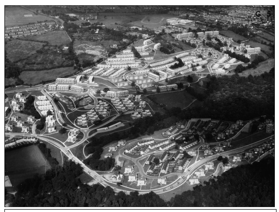
Figure 4: Newfield Green (Gleadless Valley) in the late 1960s. This estate was built across former steeply sloping fields and incorporated former field boundaries and mature woodlands.