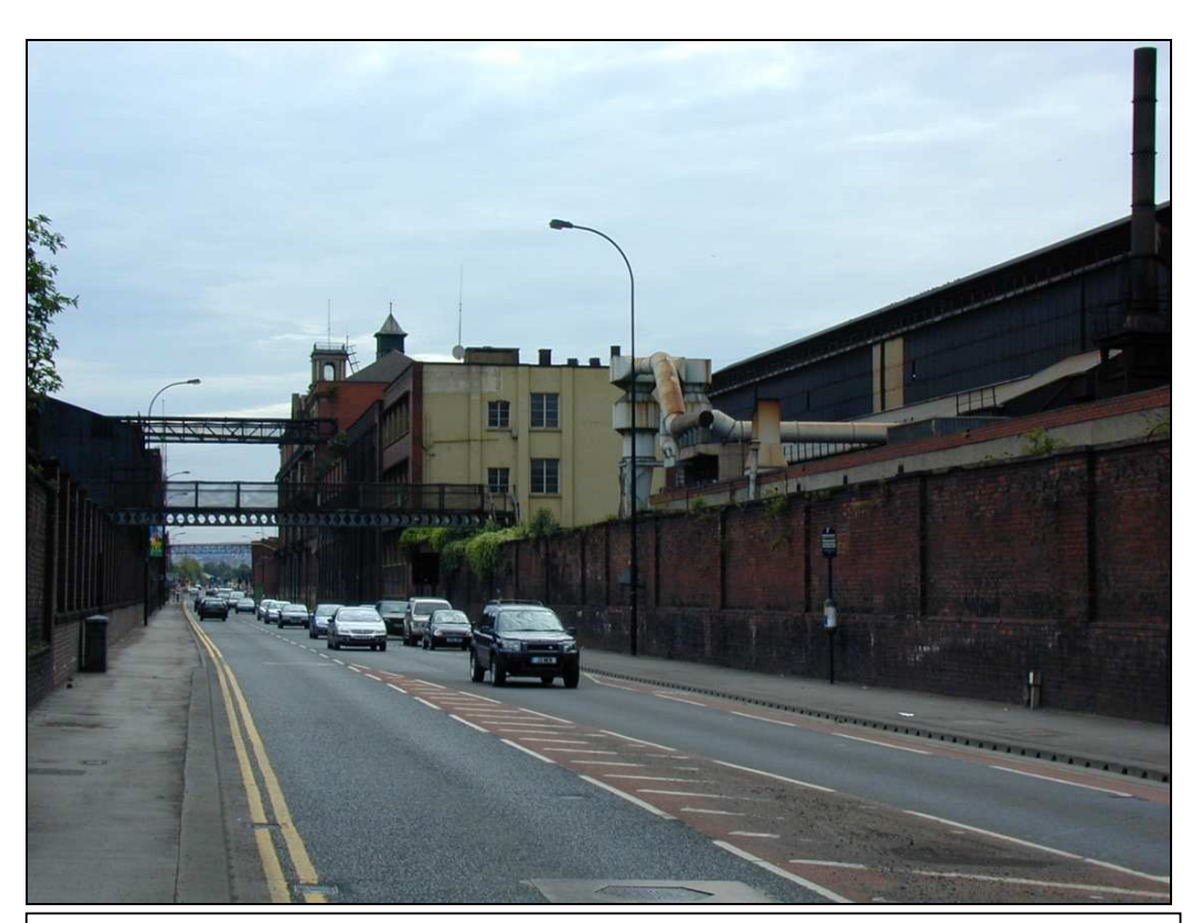
Figure 1: The 'River Don Works' of Sheffield Forgemasters straddles Brightside Road and represents one of the last working survivals of a large scale steel works established in the late 19<sup>th</sup> century.

This zone is made up of areas where large scale industrial activities, principally the production of steel and its processing by casting, forging and rolling, still form a dominant influence on the built environment. Much of the character areas to be discussed here are to be found located on the alluvial flood plains of river valleys. As well as being a location traditionally associated with the metal trades due to the location of water powered industries, these valley floors provided significant areas of level ground, an essential component of the spatial organisation of large complexes.