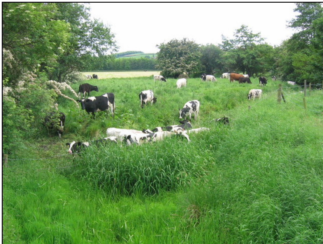
Figure 1: 'Blue Man's Bower' a medieval moated enclosure near Catcliffe lies within seasonally flooded grasslands.