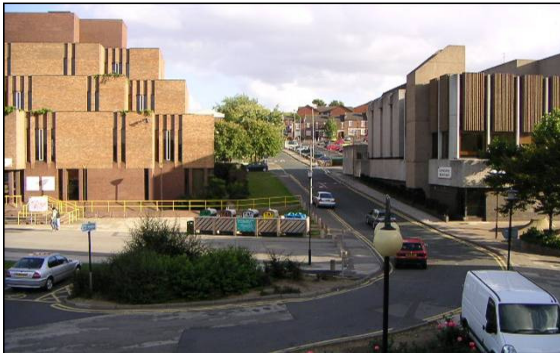
Figure 1: Norfolk House (left) and the Central Library and Arts Centre (right) are examples of the modernist architecture championed by many municipal authorities in the late 20 th century.

Image © 2005 Christopher Thomas - used under a creative commons licence http://creativecommons.org/licenses/by-sa/2.0/