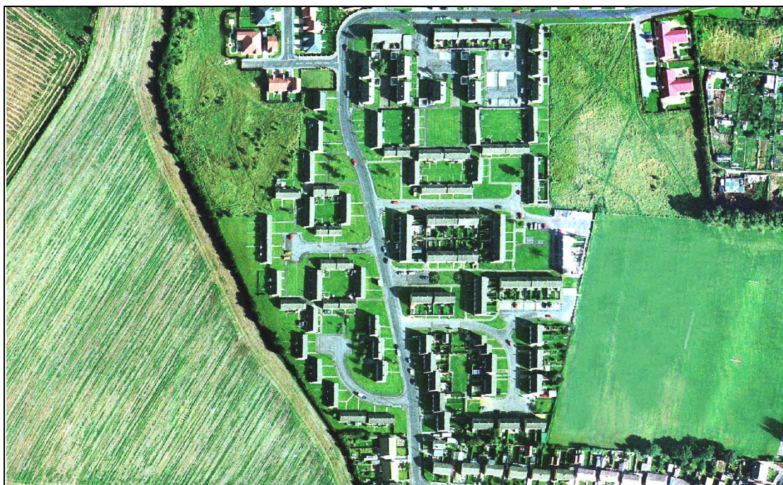
Figure 3: 'Radburn' style estate planning (seen here at New Edlington) sought to maximise separation of vehicles and pedestrians.

From the mid 1950s onwards there was a clear move away from the provision of private space to open plan estates based on the 'Radburn' principles of design. These principles, originating in a study by US architects Stein and Wright of English 'garden suburb' planning (Sheffield Corporation 1962, 12), aimed to maximise the separation of vehicles and pedestrians by avoiding points at which pedestrians would have to cross vehicle carriageways. Instead of facing on to carriageways, houses were designed to front directly onto common green spaces, without privately demarcated enclosed gardens. The 'Radburn' estates built in this zone in this period are typical of many developed nationwide from the 1950s through to the late 1970s and are generally constructed according to 'system building' techniques, typically the 'No Fines' method developed by Wimpey. Houses built in this way were cast in-situ from a concrete mix requiring no 'fine' aggregates (i.e. cement and gravel). This method could be executed quickly and cheaply - however, the resulting aesthetics of the properties, which were finished with quickly applied render, are generally regarded as bleak. Structural problems with the system include poor thermal insulation and condensation