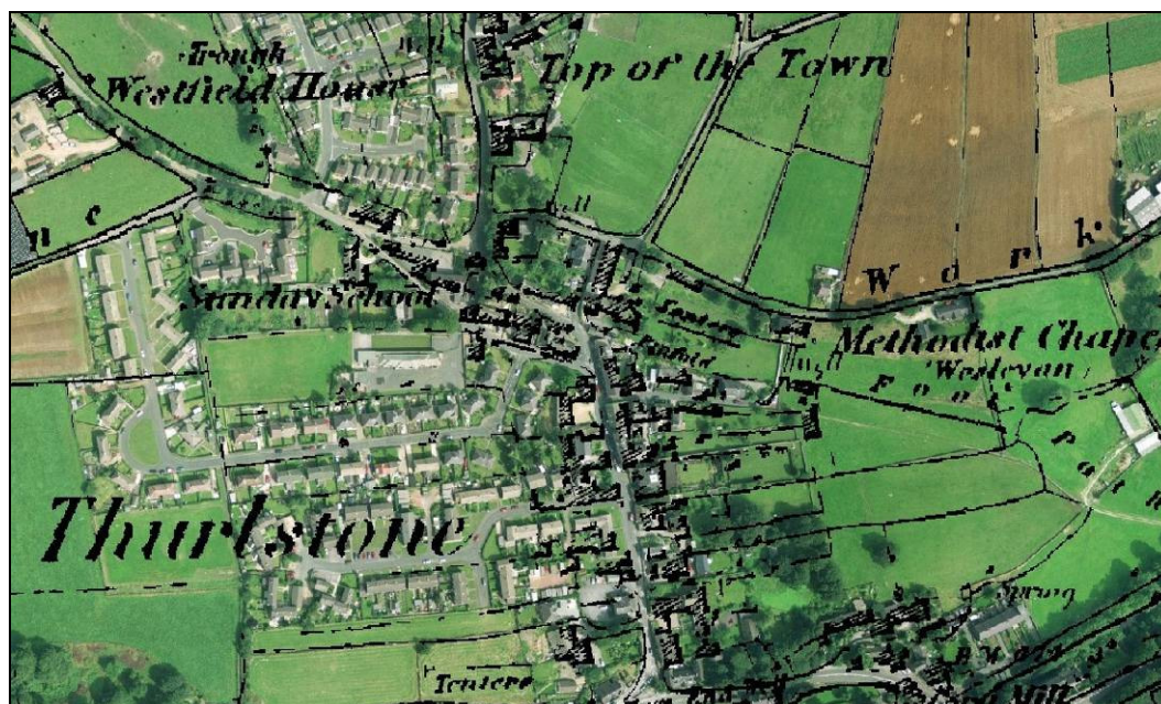
Figure 2: Thurlstone. Cities Revealed aerial photography © the GeoInformation Group, 2002 overlain with 1851 OS mapping © and database right Crown Copyright and Landmark Information Group Ltd (All rights reserved 2008) Licence numbers 000394 and TP0024

In Barnsley, both Dodworth and Monk Bretton have clear associations with high status landowners - in both cases Pontefract Priory (Monk Bretton Priory being a daughter of Pontefract) (Sykes 1993, 233-4; Hey 1986, 59). The town of Barnsley itself (described within the 'Complex Historic Town Cores' zone) was similarly replanned by the monks of Pontefract (Elliot 2002, 25-27).